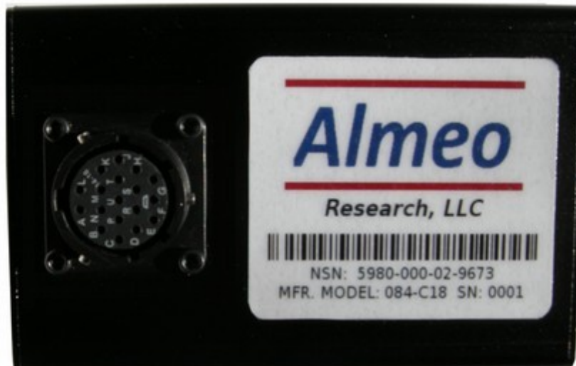
Front view of XIIP card. (103 mm long x 66 mm wide x 27 mm thick not including connector.)

Solution: An electronics module that measures fuel consumption in real-time but, also measures indicated mean effective pressure (IMEP) and engine speed. The two variables of load (IMEP) and speed can serve as a frame of reference for the meaningful comparison of test and baseline measurements. The J1321 standard describes a rationale for evaluating the performance of this normalization. The same rationale could be applied to the XIIP normalization procedure. It may turn out that the XIIP normalization is better since it is easier to collect much larger amounts of data on a single vehicle under typical service conditions.